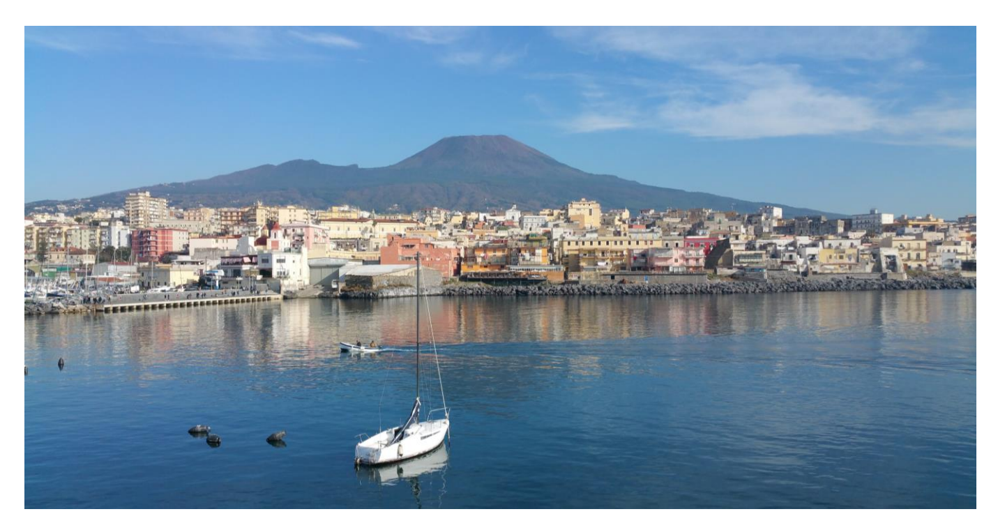
The conference will take place at Villa Doria d'Angri Via Francesco Petrarca, 80, 80123 Napoli NA, Italy

Naples is raw, high-octane energy, a place of soul-stirring art and panoramas, spontaneous conversations and unexpected, inimitable elegance. Welcome to Italy's most unlikely masterpiece. Naples' millennia-old backstory could bust a bookshelf. Settled by the Greeks and conquered by the Romans, it's a nail-biting tale where myth and fact entwine into one bewitching whole. Curious tales and unsolved mysteries seep out of every Neapolitan stone, casting a strange, hypnotic spell. Naples' wealth of cultural assets is extraordinary. You'll find two royal palaces, three castles, and ancient ruins that include some of Christianity's oldest frescoes. The city's Museo Archeologico Nazionale claims the world's finest collection of Pompeiian frescoes and mosaics, while its Cappella Sansevero holds Italy's most extraordinary marble sculpture. Blessed with rich volcanic soils, a bountiful sea, and countless generations of culinary knowhow, the Naples region is one of Italy's epicurean heavyweights. It's here that you'll find the country's best pizza, pasta and espresso, its most appetising street markets, not to mention some of its most celebrated dishes.